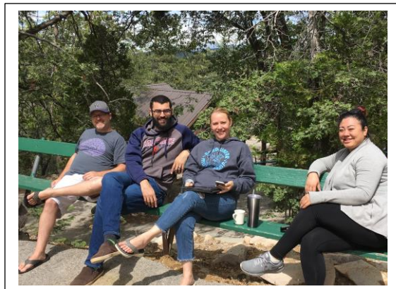
Choral Conductors - 2019