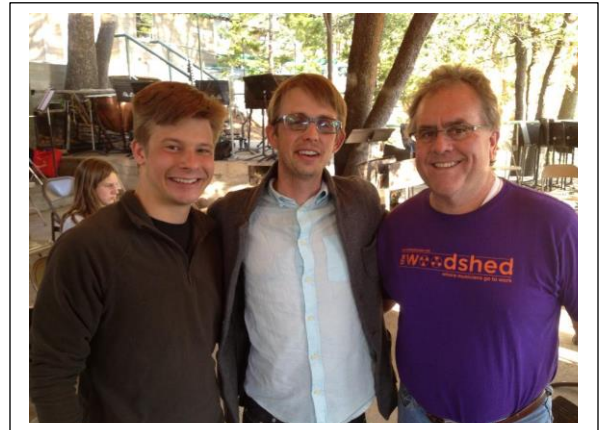
Jazz Conductors - 2019