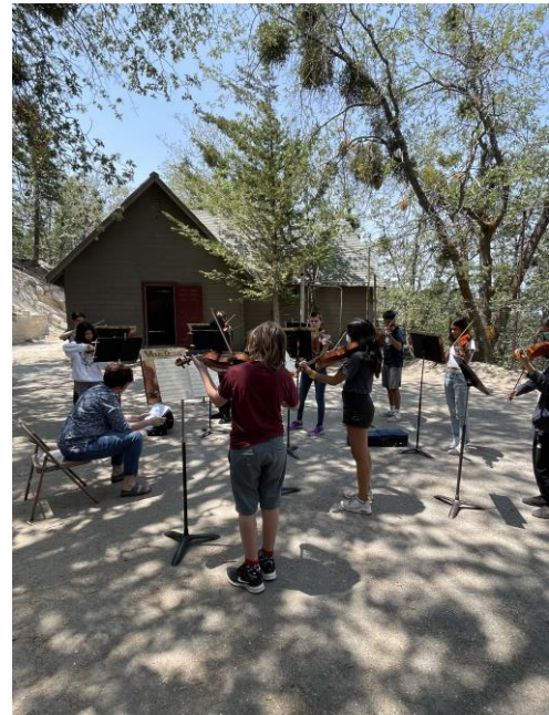
Boys Dorm – Intermediate 2021